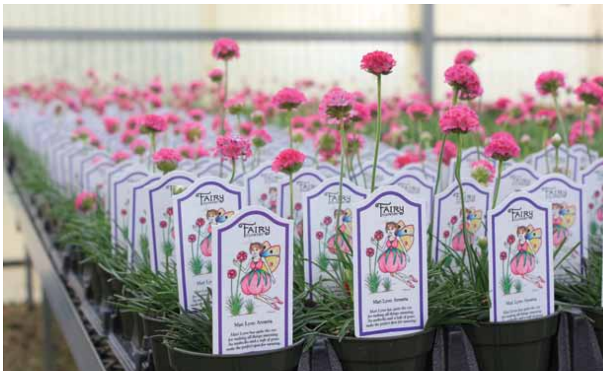
Above: Armeria on greenhouse bench.