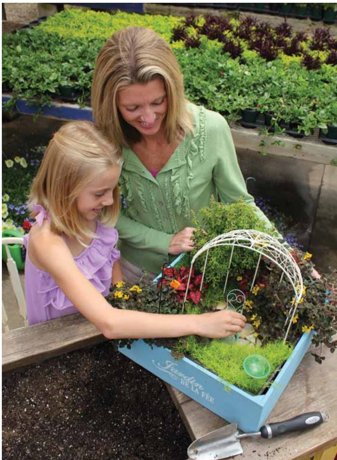
Fairy gardening has become a way to bridge the gap between young and old gardeners.

You may be hesitant to invest the money and energy to add something new right now, but for a very minimal