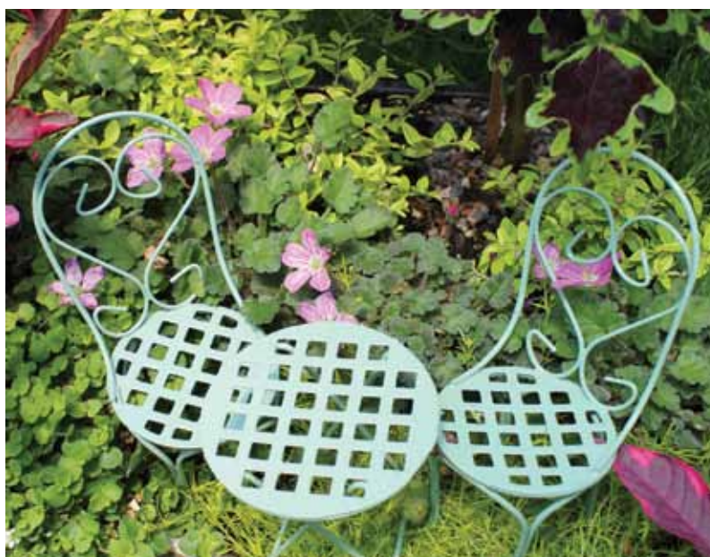
Left: Mini bistro set available with Fairy Flowers.

pruning may be required. Fortunately, most of the plants in the Fairy Flowers line recover quickly. If necessary, simply cut back up to one third of the total height and the flowers should be salable again within two weeks.